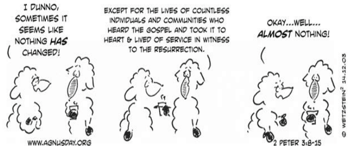
Agnus Day appears with the permission of www.agnusday.org (Based on 2 nd Reading from the Second letter of Peter: 3:8-14)